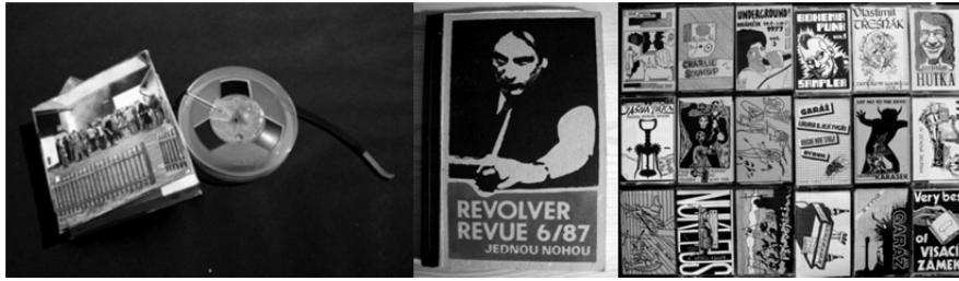
Fig. 6: Left: Plastic People of the Universe, Passion Play , magnetizdat, ¼ inch audio tape, 1978; centre: Revolver Revue , 1987; right: magnetizdat handmade cassette covers distributed by Petr Cibulka, 1970s-80s

Revolver Revue would include advertisements for materials such as audio recordings on cassette as well as unofficial events including concerts.