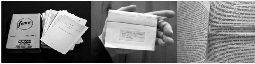
Fig. 4: Left: Foma photo book; centre and right: Kolibřík edition, with detail view of magnifier

camouflage and the industry-standard black lightproof paper protecting its contents from prying eyes, or at least creating doubts to the nature of the contents, since opening a box of unexposed photo paper would mean destroying it. Thus a technology of perfect reproduction was used simultaneously as a technology of dissimulation.