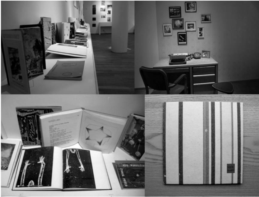
Fig. 3: Views of the exhibition in New York City

in broad themes to focus on areas including music, art, novels, religious and historical treatises, philosophy, politics, etc., with many overlapping categories.